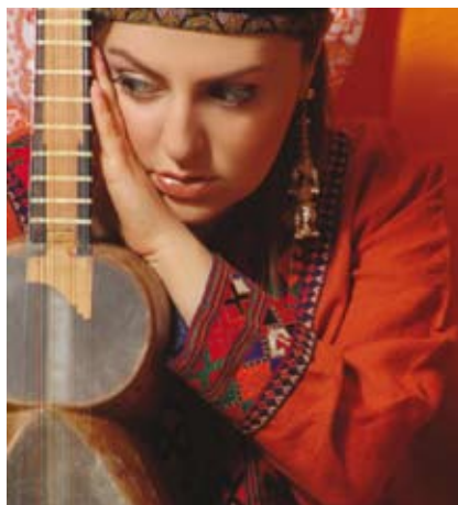
Sevda Azeri Jazz Project